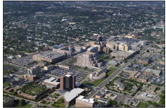
THE CLEVELAND CLINIC Cleveland, Ohio

Ultimately, the Clinic chose to follow Integrity’s interim transportation plan and use its number one recommended parking site as the best alternative to serve the Clinic’s substantial employee parking needs.